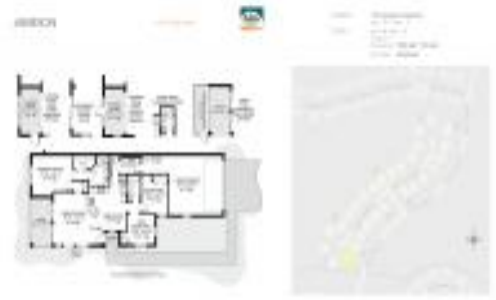
© 2024 Sun City Center Community Association

Sun City Center: $183/sq. ft. Hillsborough: $255/sq. ft.