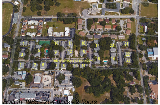
Built in 1985 - 204 units - 2 floors