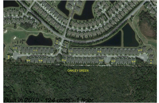
Built in 2010 - 124 units - 1 floor

The above valuated price is a baseline figure that does not take into account any specific renovation, upgrade, split, merge, or deterioration of the unit.