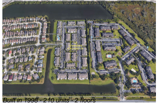
Built in 1998 - 210 units - 2 floors