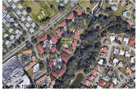
Built in 1982/1990 - 106 units - 2 floors