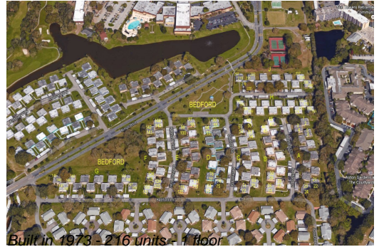
Built in 1973 - 216 units - 1 floor