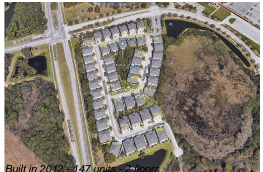
Built in 2012 - 147 units - 6-8 floors