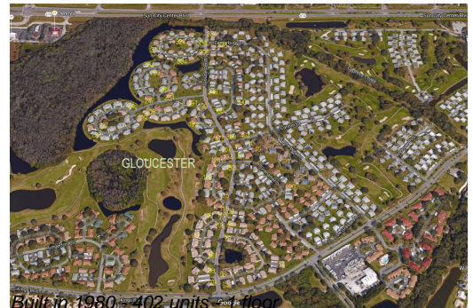
Build in 1980 - 402 units - 4200 sq ft floor