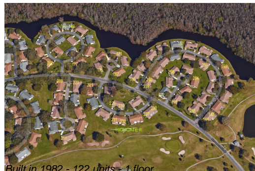
Built in 1982 - 122 units - 1st floor