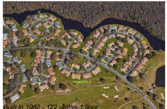
Built in 1982 - 122 units - 1st floor