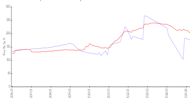
Sunset Bay Townhomes vs Apollo Beach