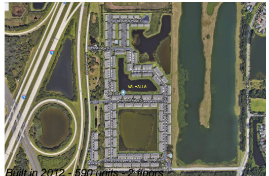
Built in 2012 - 590 units - 2 floors