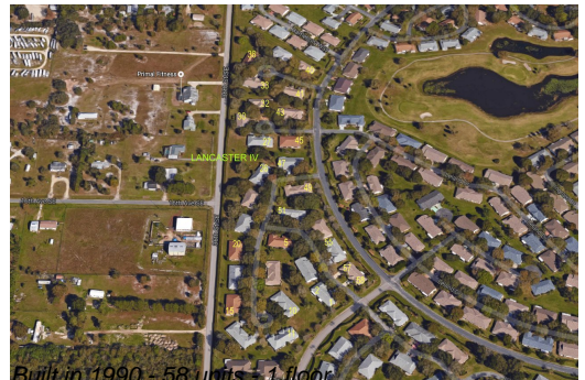
Built in 1990 - 58 units - 1 floor