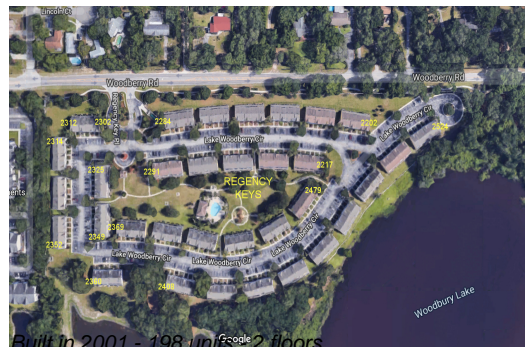
Built in 2001 - 198 units, 2 floors