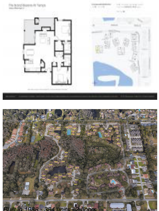
Built in 1988 - 384 units - 2 floors