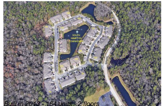
Built in 2013 - 164 units - 2 floors