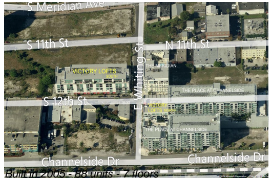
Built in 2005 - 88 units - 7 floors