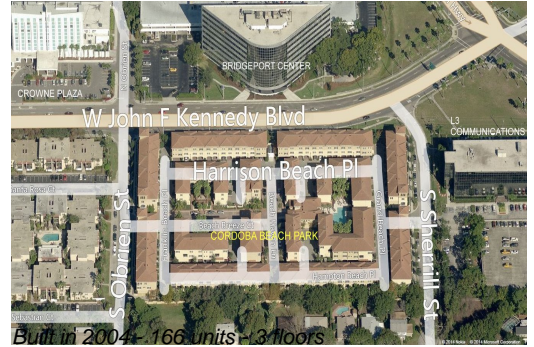
Built in 2004 - 166 units - 3 floors