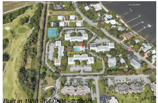
Built in 1980 - 64 units - 2 floors