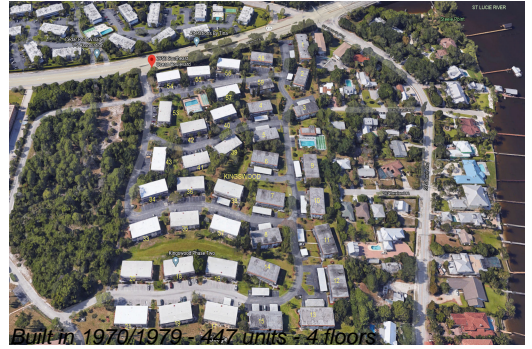
Built in 1970/1979 - 447 units - 4 floors

The above valuated price is a baseline figure that does not take into account any specific renovation, upgrade, split, merge, or deterioration of the unit.