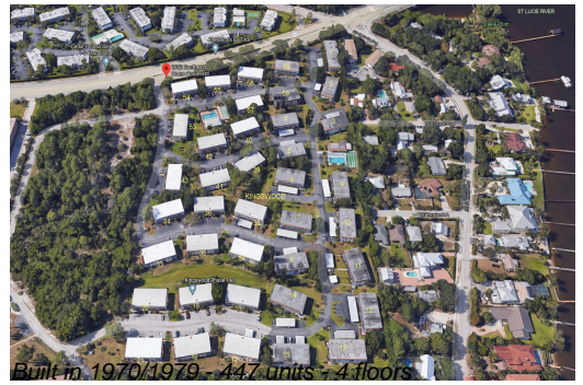
Built in 1970/1979 - 447 units - 4 floors

The above valuated price is a baseline figure that does not take into account any specific renovation, upgrade, split, merge, or deterioration of the unit.