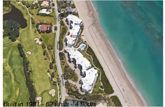
Built in 1981 - 62 units - 4 floors

The above valuated price is a baseline figure that does not take into account any specific renovation, upgrade, split, merge, or deterioration of the unit.