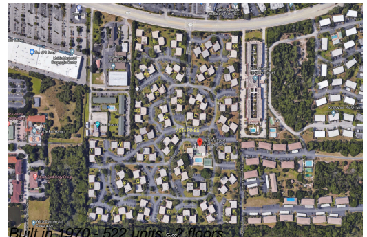
Built in 1970 - 522 units - 7 floors