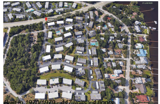
Built in 1970/1979 - 447 units - 4 floors