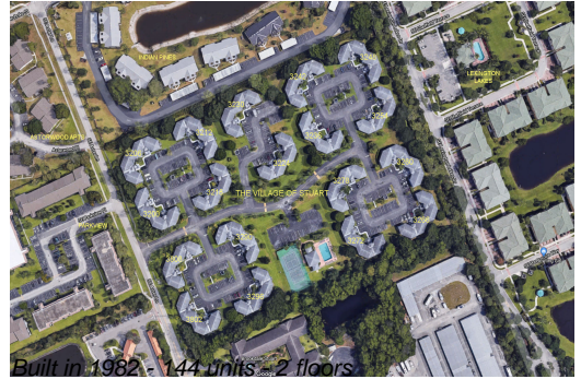
Built in 1982 - 144 units - 2 floors