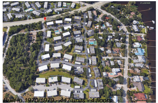
Built in 1970/1979 - 447 units - 4 floors

The above valuated price is a baseline figure that does not take into account any specific renovation, upgrade, split, merge, or deterioration of the unit.