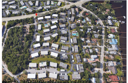
Built in 1979/1979 - 447 units - 4 floors