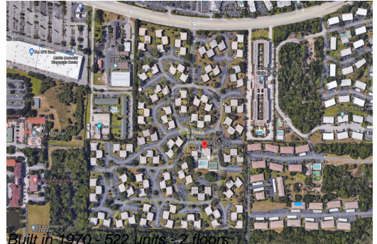
Built in 1970 - 522 units - 2 floors