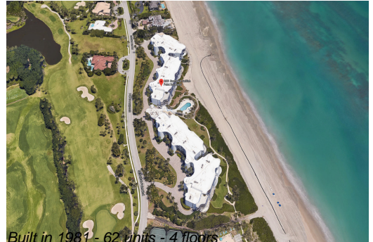
Built in 1981 - 62 units - 4 floors