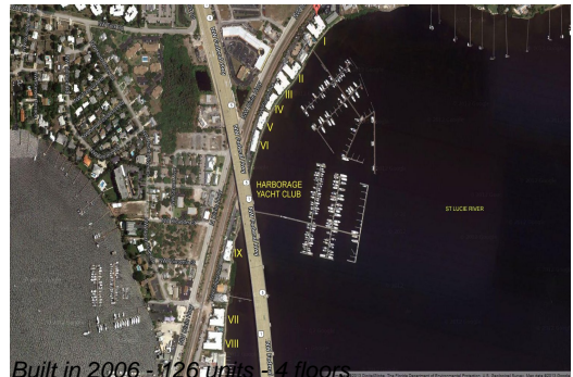
Built in 2006 - 126 units - 4 floors