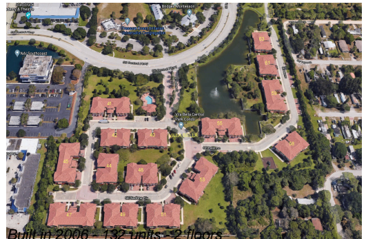
Built in 2006 - 132 units - 2 floors