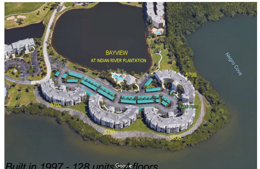
Built in 1997 - 128 units, Good floors