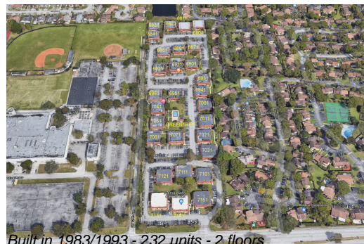
Built in 1983/1993 - 232 units - 2 floors