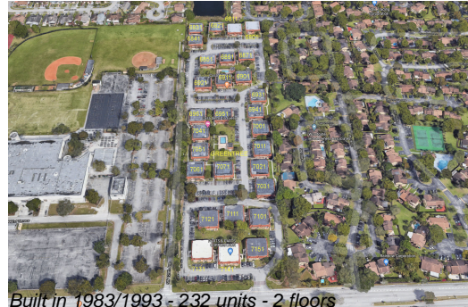
Built in 1983/1993 - 232 units - 2 floors