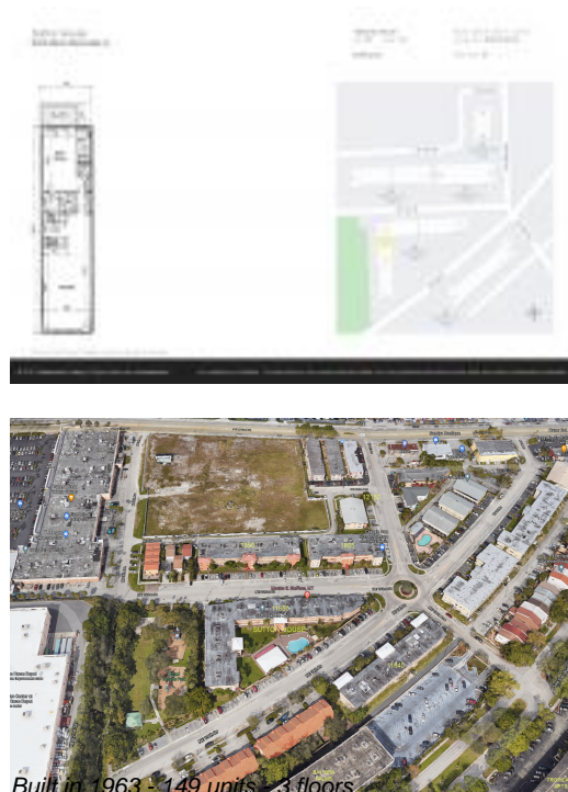
Built in 1963 - 149 units - 3 floors