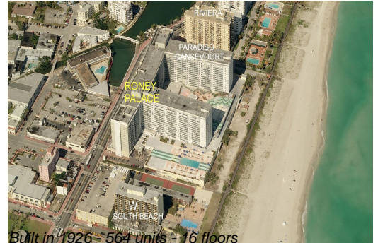
Built in 1926 - 564 units - 16 floors