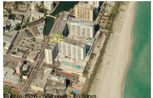
Built in 1926 - 564 units - 16 floors