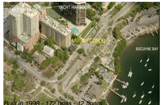
Built in 1998 - 172 units - 12 floors