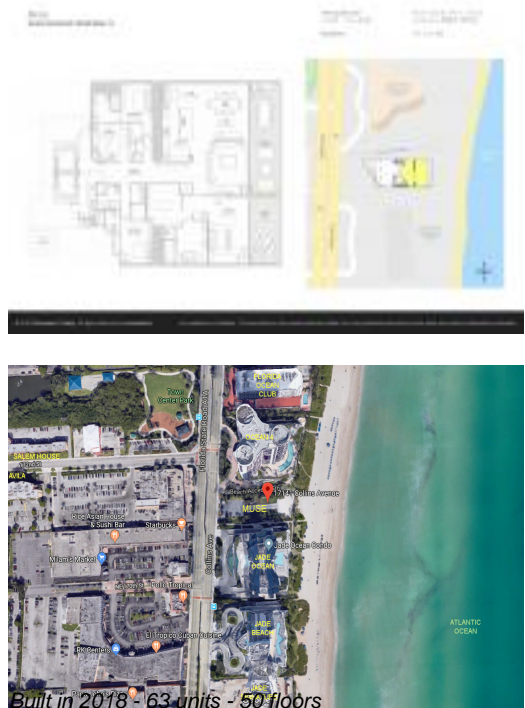
Built in 2018 - 63 units - 50 floors