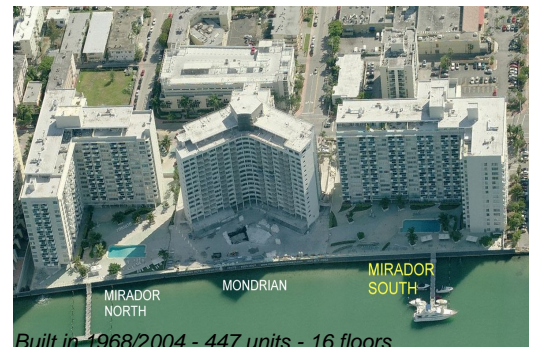
Built in 1968/2004 - 447 units - 16 floors