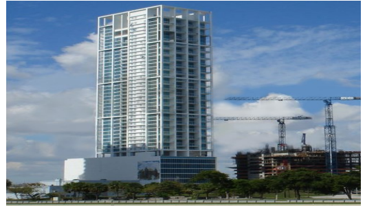
Built in 2007 - 200 units - 48 floors