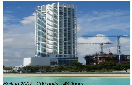
Built in 2007 - 200 units - 48 floors