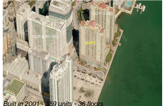
Built in 2001 - 359 units - 36 floors