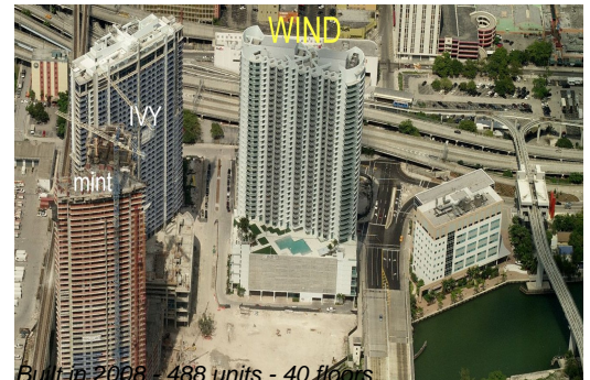
Build in 2008 - 488 units - 40 floors