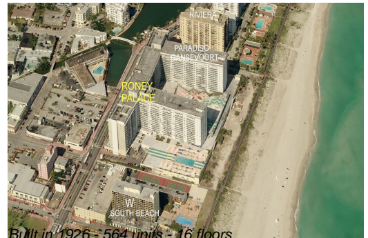
Built in 1926 - 564 units - 16 floors