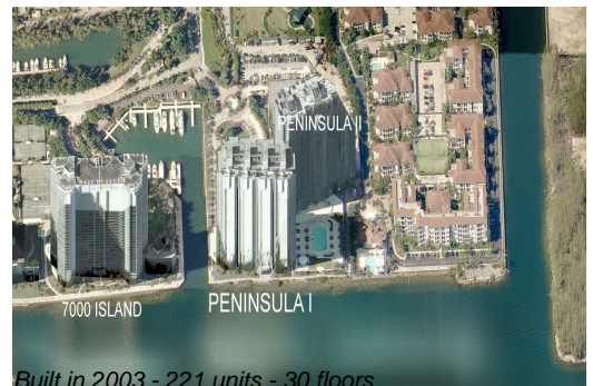
Built in 2003 - 221 units - 30 floors