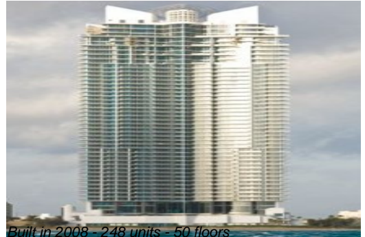
Built in 2008 - 248 units - 50 floors