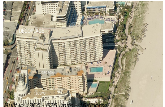
Built in 1965 - 625 units - 10 floors