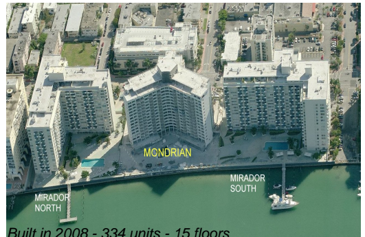
Built in 2008 - 334 units - 15 floors