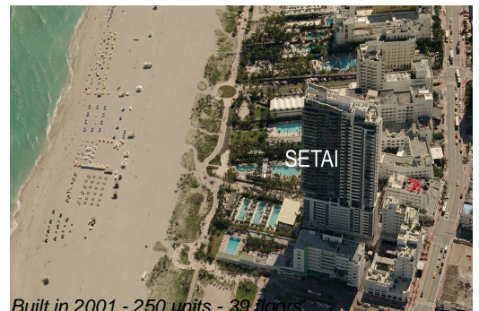
Built in 2001 - 250 units - 39 floors