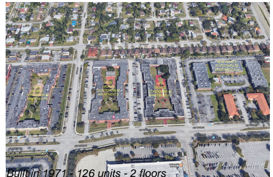
Built in 1971 - 126 units - 2 floors