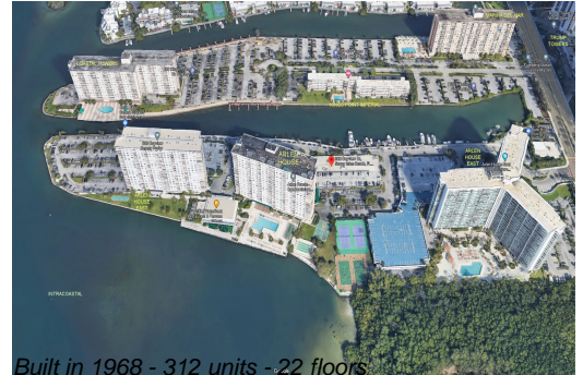
Built in 1968 - 312 units - 22 floors